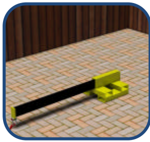
The two attachment "modes"