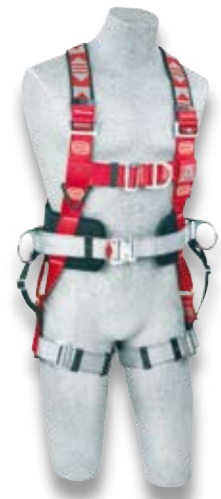
AB126336 (with standard buckles)

Model shown : AB127334 (with tongue and grommet buckles)