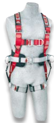
AB128336 (with automatic buckles)