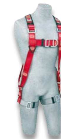
AB12333 (with standard buckles)