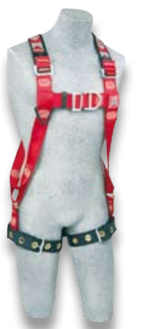
AB12433 (with tongue and grommet buckles)