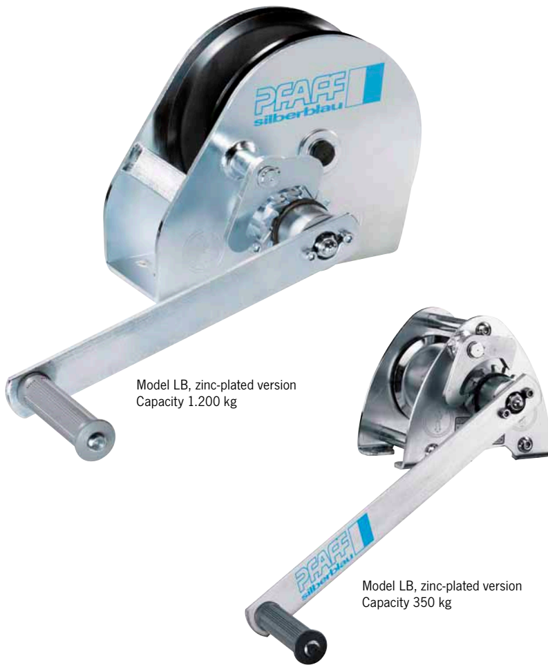
Model LB, zinc-plated version Capacity 1.200 kg