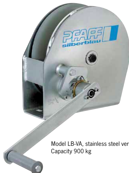
Model LB-VA, stainless steel version Capacity 900 kg