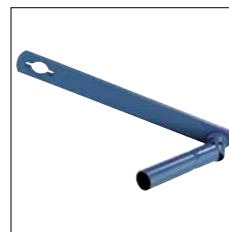
Option: Foldable crank with tiltable handle for use in confined spaces.